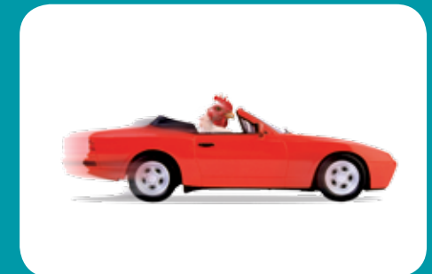
The chicken-friendly transport system